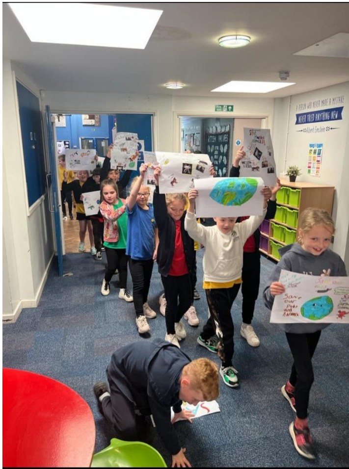
Re-enacting a protest